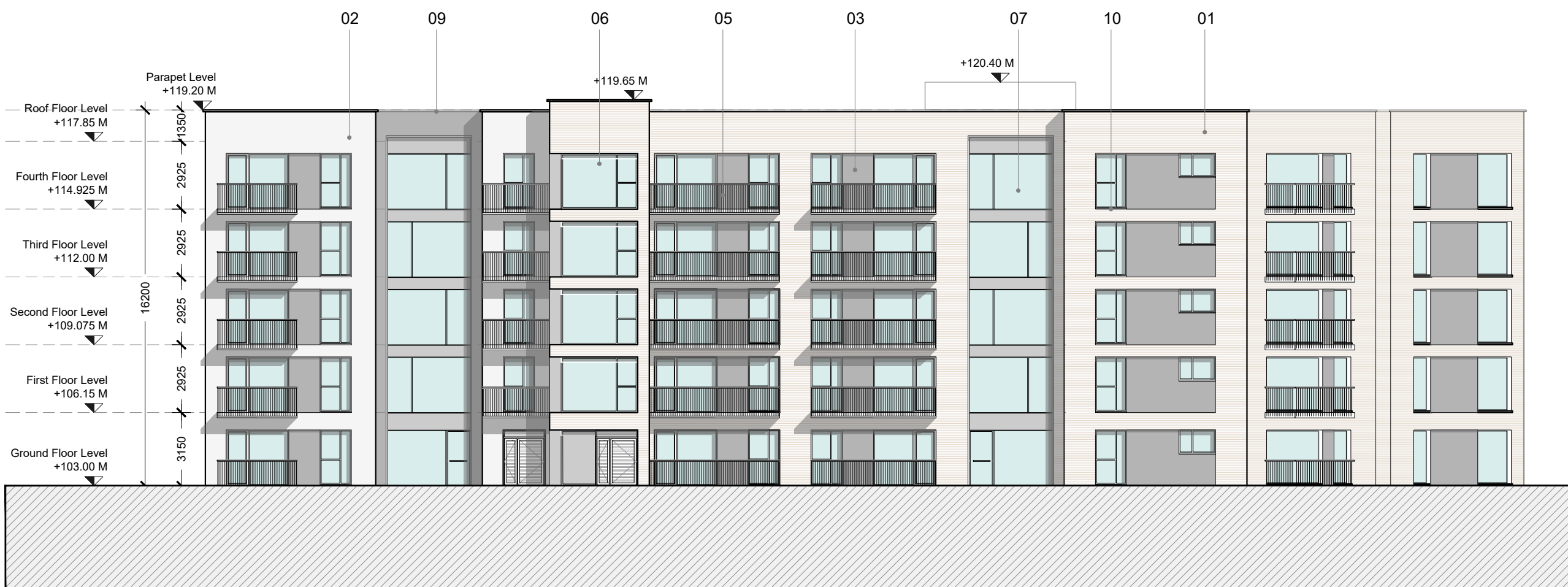
Block D_North West Elevation Scale 1:200 @ A1