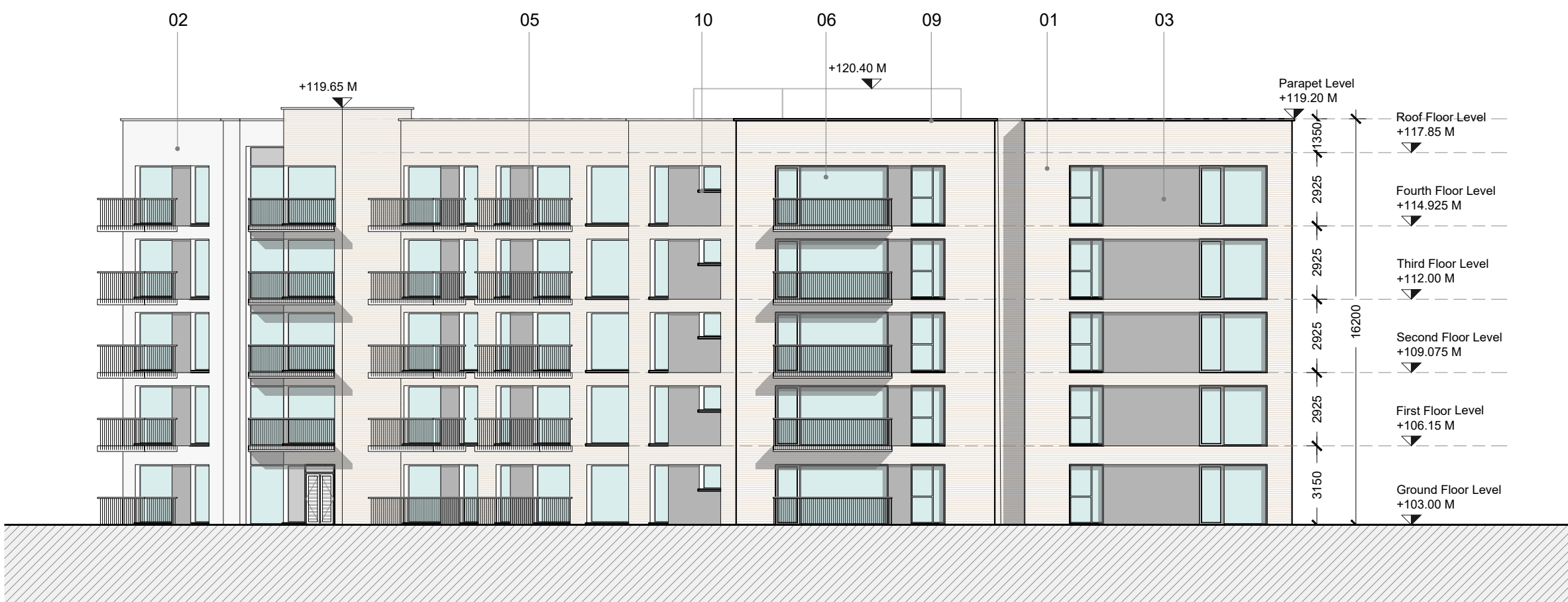
Block D_West Elevation Scale 1:200 @ A1