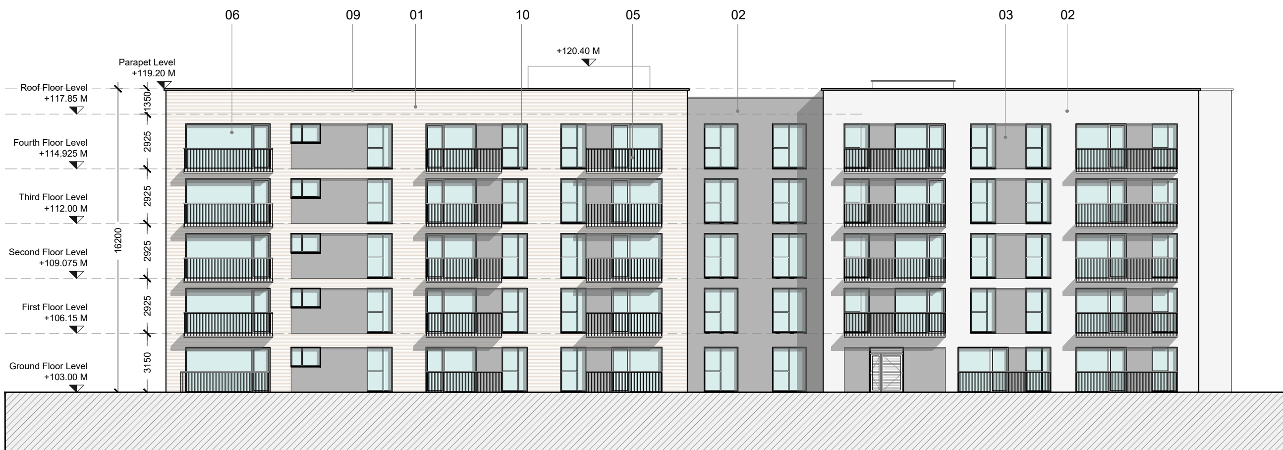
Block D_South East Elevation Scale 1:200 @ A1