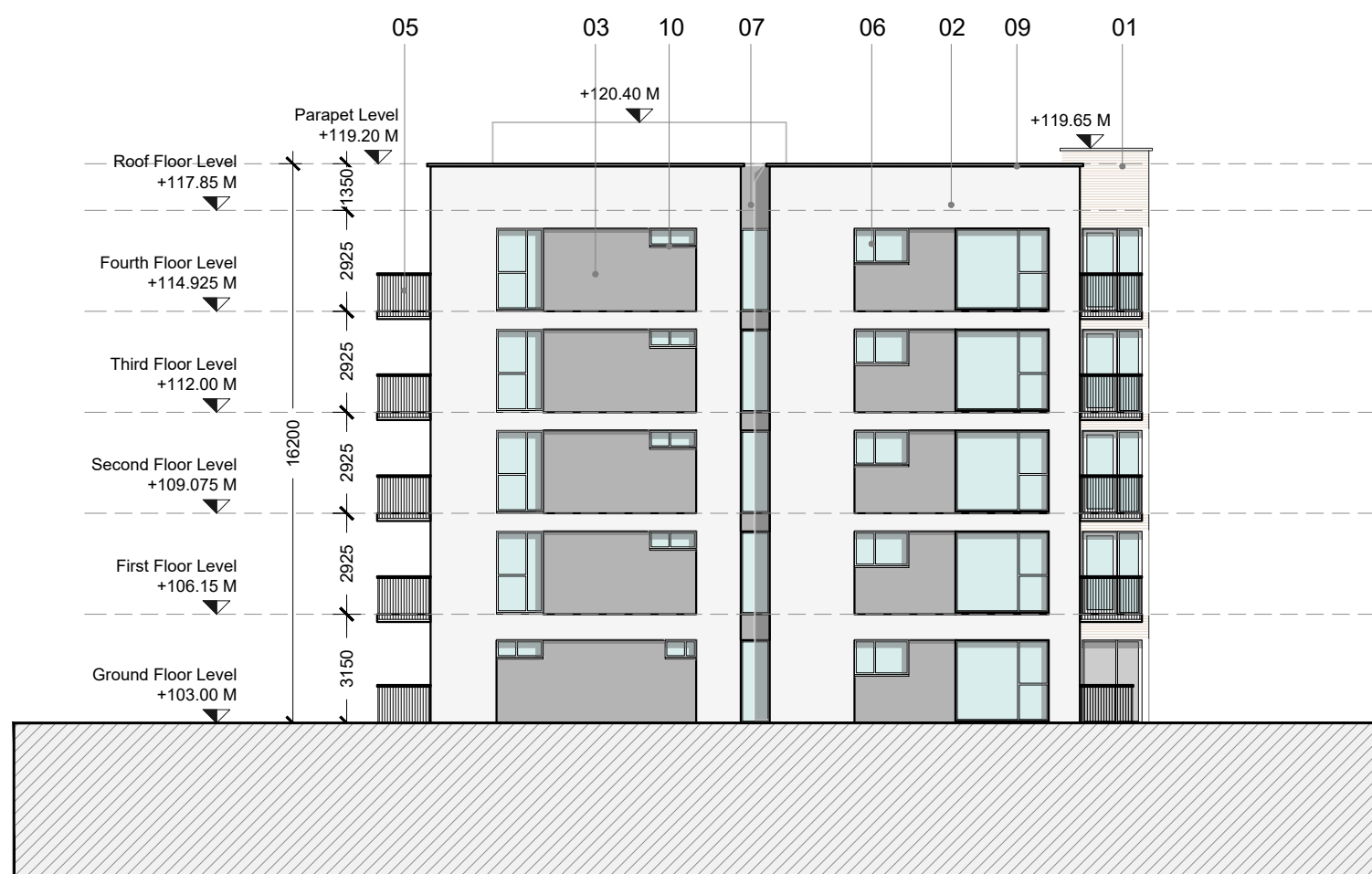
Block D_North East Elevation Scale 1:200 @ A1